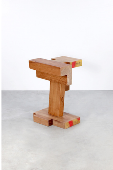
Bufagus stool Reclaimed wood 44,5cm x 32cm x 25cm