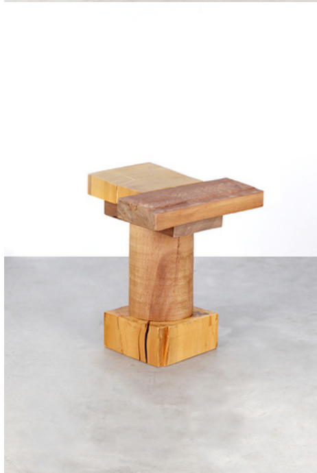
Bufagus stool Reclaimed wood 40cm x 32cm x 33cm