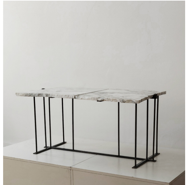
Table du collectionneur

Height : 50 cm Width : 120 cm Depth : 50 cm