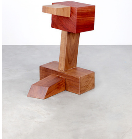
Bufagus stool Reclaimed wood 46cm x 27cm x 19cm