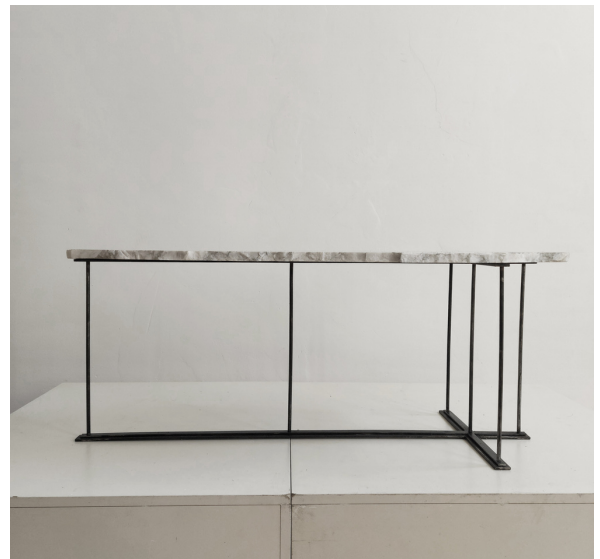
Table du collectionneur

Height : 40 cm Width : 100 cm Depth : 30 cm